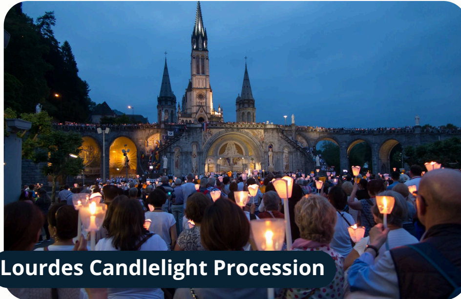
Lourdes Candlelight Procession